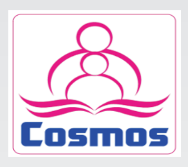
COSMOS IMPACT FACTOR